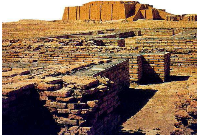
Ruins in Ur of the Chaldees

They set out: for the land of Canaan. At a normal caravan pace of 20 miles per day, the trip from Haran to Canaan (about 500 miles) would have taken the better part of a month. There are three primary names by which we know the Promised Land: 1. Canaan (possibly meaning “low” or “lowland”) because of the original inhabitants; 2. Israel (after the conquest led by Joshua) 3. Palestine (from Philistine) the name given to the land by the Romans